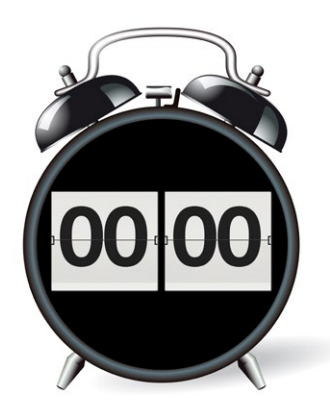
66 We find our Zero Point, the place where we become truly present 99

If we accept Antonio Damasio's(*3) 'embodied mind' suggestion (that our body and emotions are not really separate from our thinking), then if we stop the internal dialogue, are we left with just feeling (emotional and/or physical)? Does internal dialogue